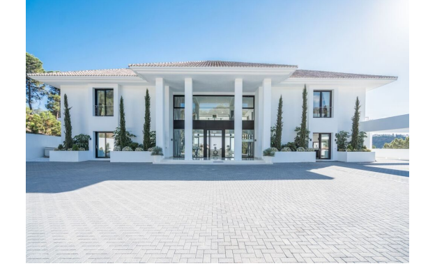
Luxury Ultra Modern Villa in Stunning Location La Zagaleta, Marbella <u>€11,900,000</u>

Frontline Golf Mansion For Sale Nueva Andalucia, Marbella <u>€13,500,000</u>