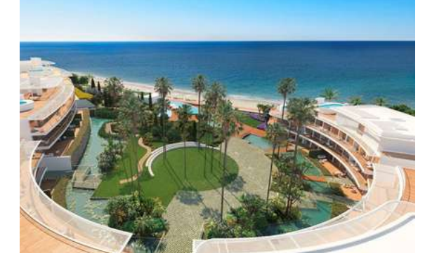
New Exceptional Beachfront Apartments Estepona, Marbella <u>€1,150,000</u>