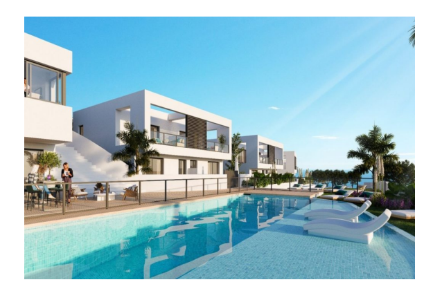
Contemporary Off-Plan Homes in East Marbella Marbella East <u>€480,000</u>

Whether you are a keen golfer or not, there is no denying that living next to a golf course offers considerable benefits. The sense of space and privacy that comes with a perfectly maintained golf course adjacent to your home is a huge bonus when considering where to purchase.