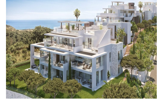
Three Bedroom Residence in Luxury New Development Marbella East €820,000