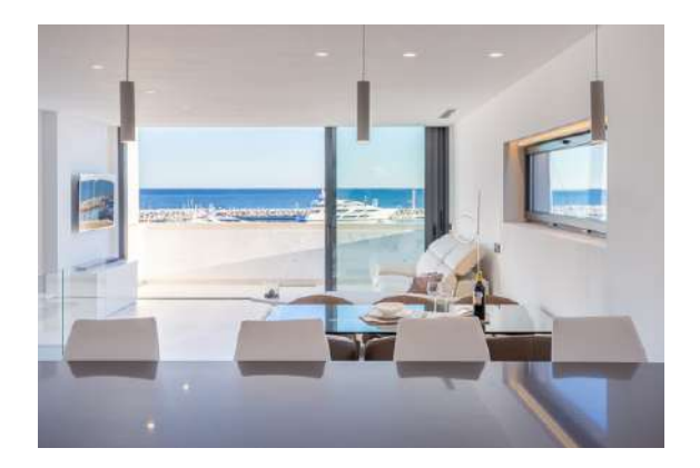
Luxurious Duplex Penthouse, First Line Puerto Banus, Marbella <u>€999,000</u>

Explore our selection of stunning beachfront properties for sale. Nothing can quite compare to waking up in the morning to the sound of the Mediterranean lapping gently onto the adjacent sandy shore