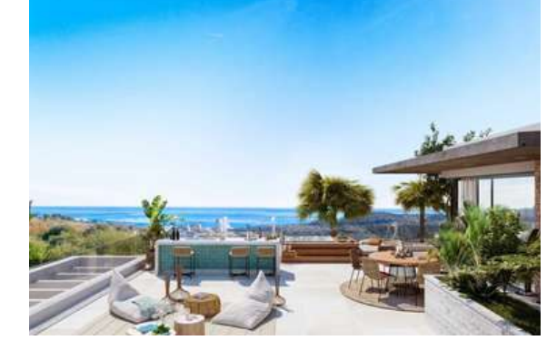
Contemporary Luxury Villa in a Golf Valley