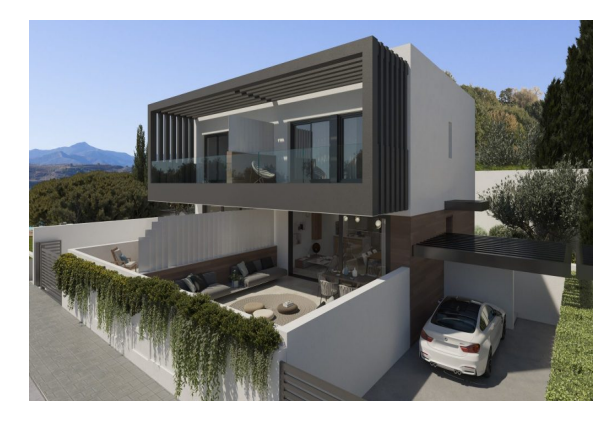
Contemporary Semi-Detached Villa For Sale

Are you looking for a property that will be a sound investment? Maybe allowing for a combination of personal usage and rental income? Or perhaps just rental income and capital appreciation? As one of Marbella's leading luxury villa rental companies, we aim to have most options covered.