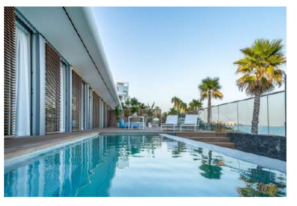
Modern Beachfront Villa in New Golden Mile Estepona, Marbella €2,395,000