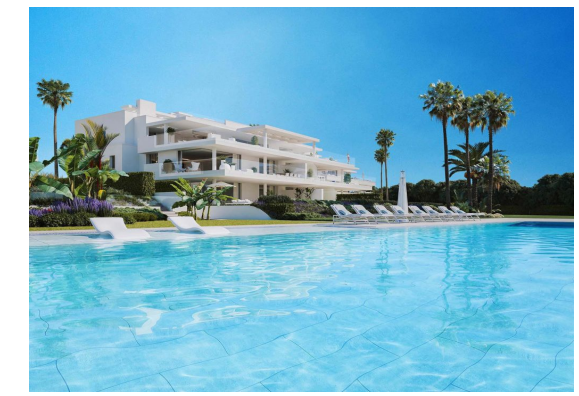
Penthouse For Sale €8,900,000